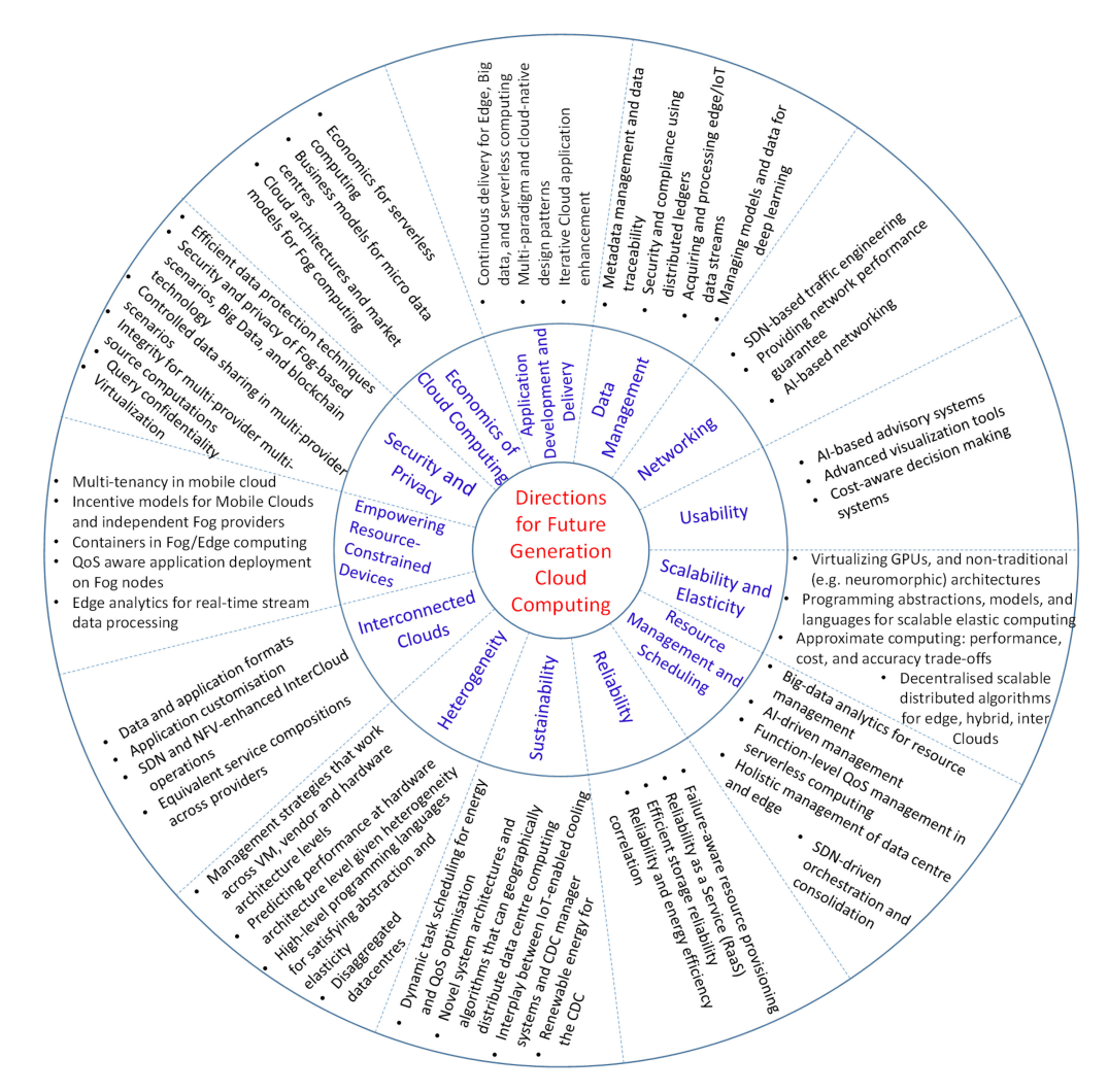
Fig. 3. Future research directions in the Cloud computing horizon.

heterogeneity, scale and load balancing applications developed through PaaS. Serverless computing is an emerging trend in PaaS, which is a promising area to be explored with significant practical and economic impact. Interesting future directions are proposed such as function-level QoS management and economics for serverless computing. In addition, future research directions for data management and analytics are also discussed in detail along with security, leading to interesting applications with platform support such as edge analytics for real-time stream data processing, from the IoT and smart cities domains.